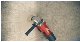
1, Surface Treatment