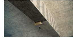
4, impregnated adhesive