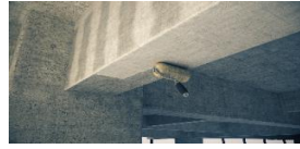
2, Apply Primer