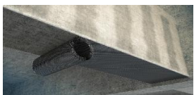
6. Pasting CF cloth