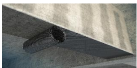
6. Pasting CF cloth