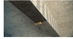
4, impregnated adhesive