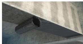
Pasting carbon fiber cloth