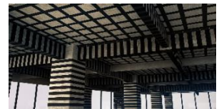
Curing and protecting