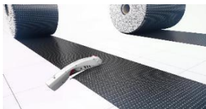
Cutting carbon fiber cloth