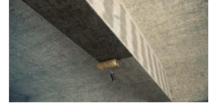
Applying epoxy resin adhesive